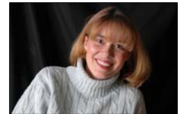
Submitted by Amber McCants

There are stage performances and free activities that encourage developmentally appropriate activities for all children.