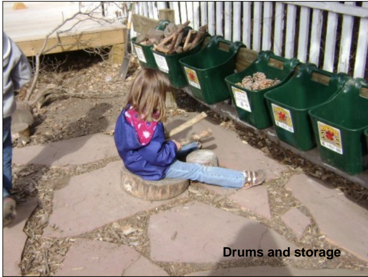
Drums and storage

St. John's Child Care Seward, NE Spring, 09