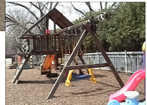
St. John's Child Development Center