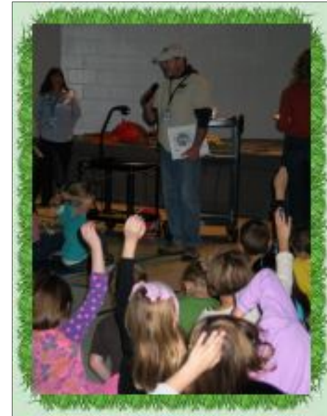
Our master gardener answers questions