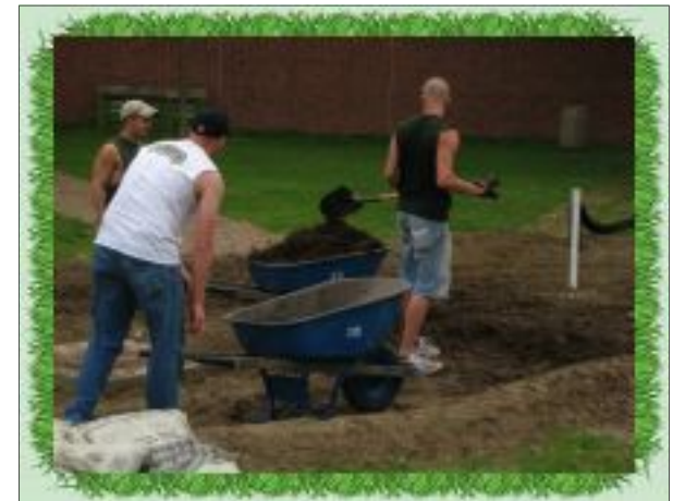
Once the ground was dry enough, the team from Campbell's got right to work.