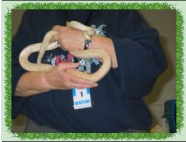
Nature Center Snake