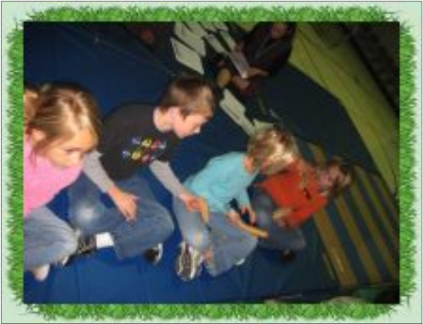
Students examine natural objects