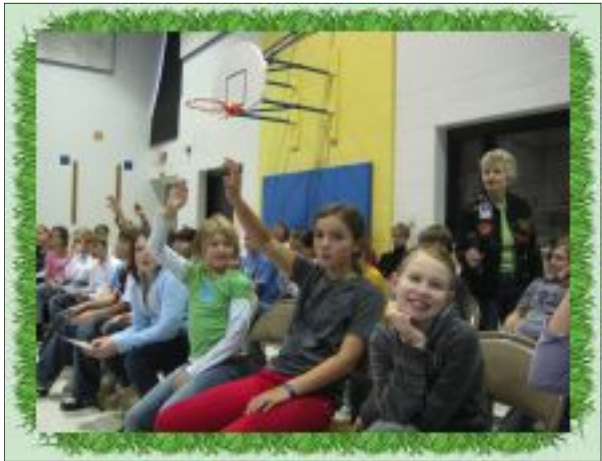
Lots of Questions