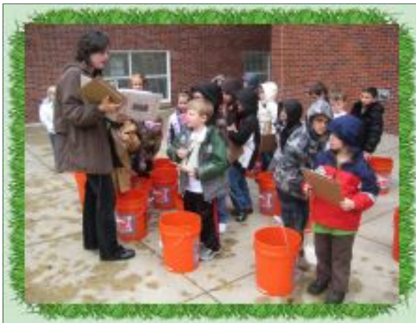
A class sets out to write in the outdoor space