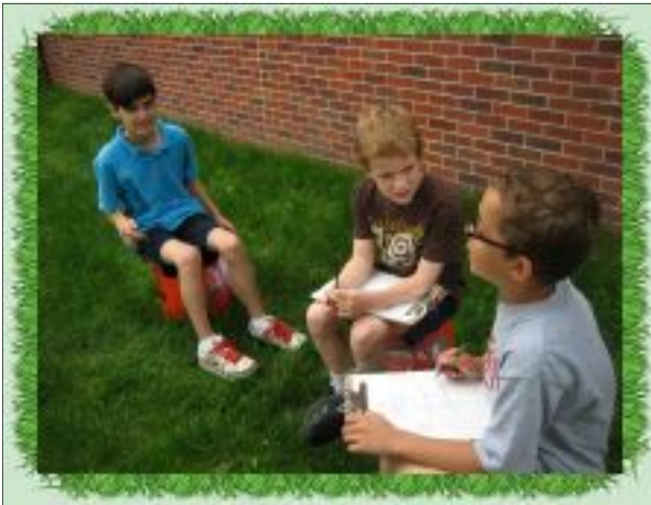
Students are already enjoying the outdoor learning space.