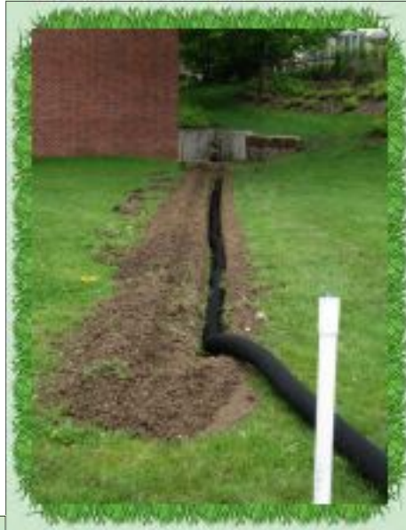
The rain garden is first on the to-do list.