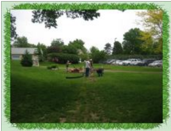
Ironically, the rain garden couldn't be installed until the rain finally ceased.