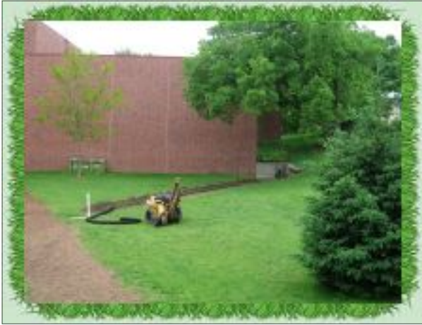
After a long, hard winter work on the Outdoor Classroom begins again