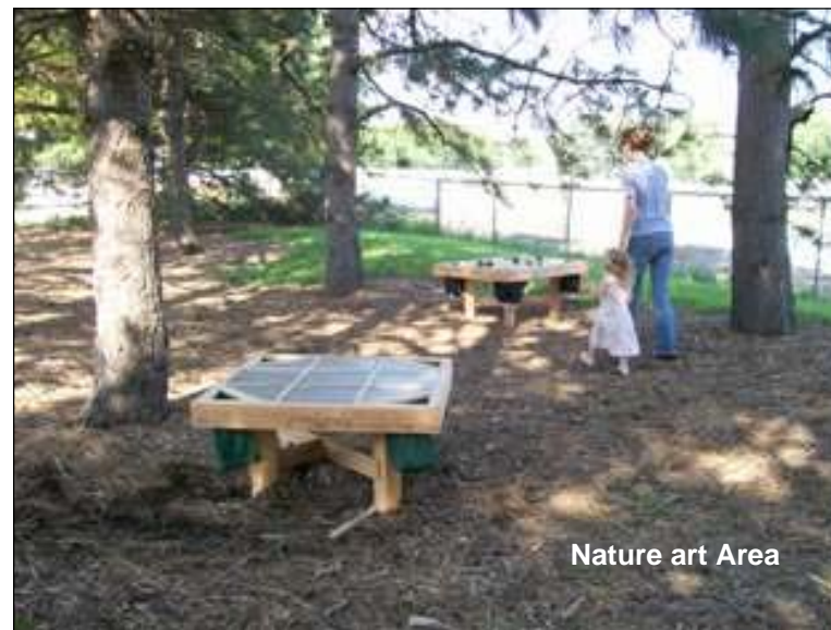
Nature art Area