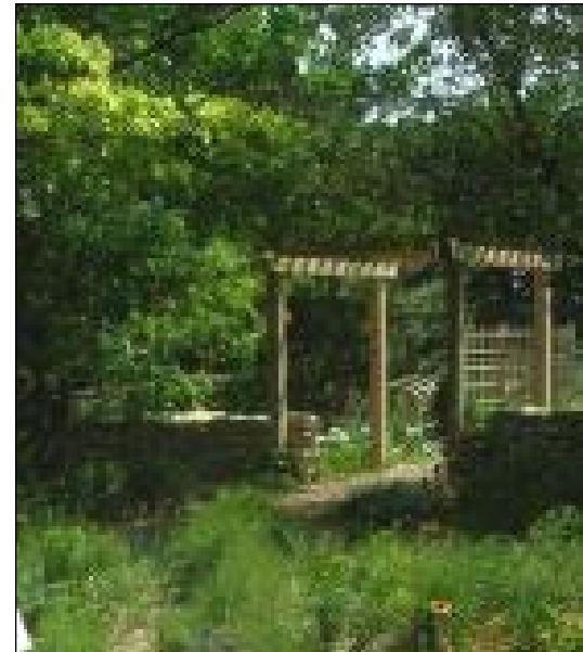
ALL PHOTOS PROVIDED BY INDIVIDUAL SITES