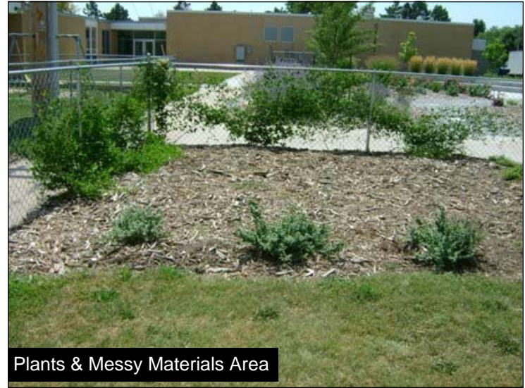
Plants & Messy Materials Area