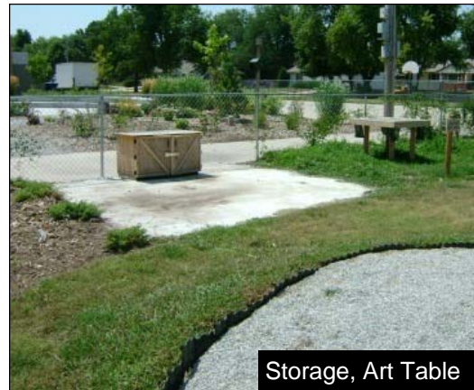
Storage, Art Table