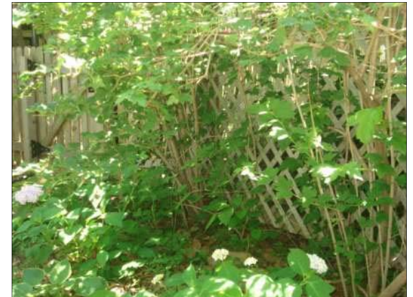
Snowball Bush hide-away