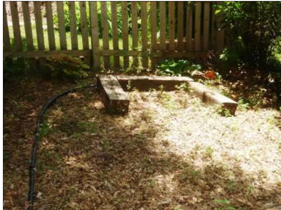
Messy Materials Area