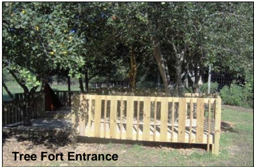
Tree Fort Entrance