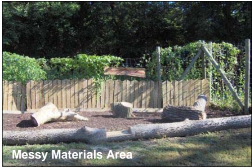
Messy Materials Area