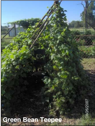
Green Bean Teepee