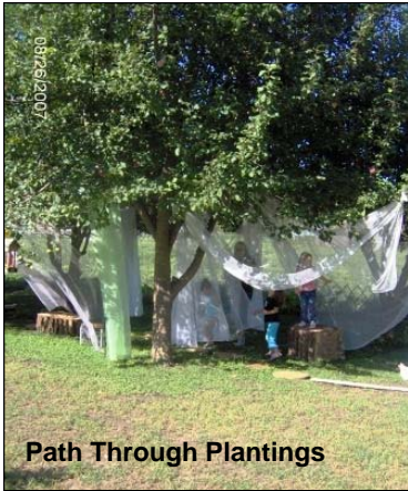
Path Through Plantings