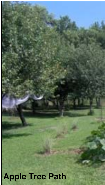
Apple Tree Path