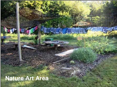
Nature Art Area