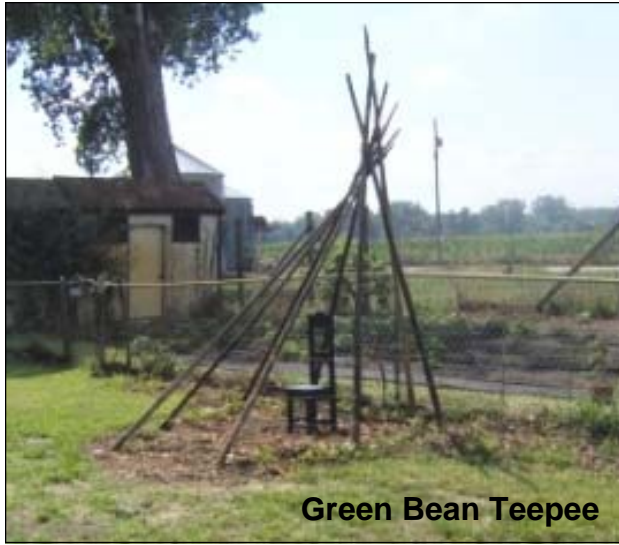
Green Bean Teepee