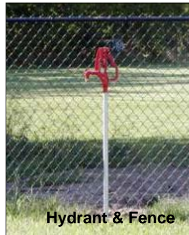
Hydrant & Fence