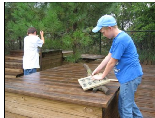
Boy Scout Troop making & posting signs