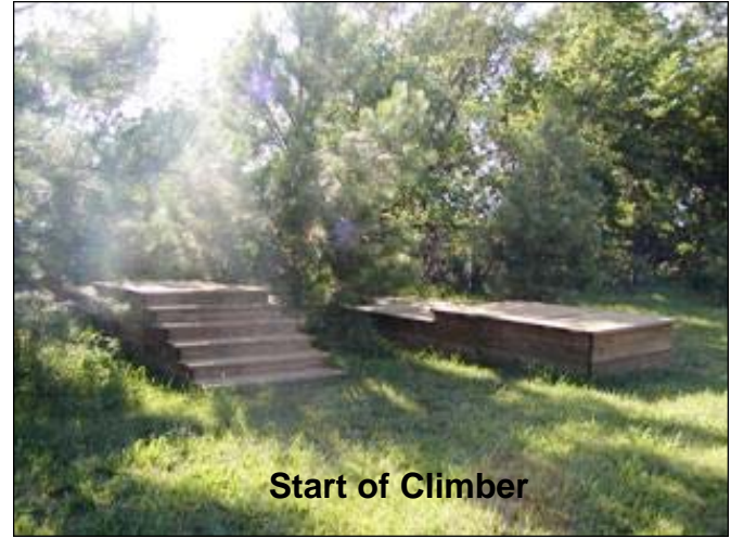
Start of Climber

SUMMER, 2007 Webster Co Early Learning Center Blue Hill